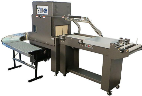
Shown with optional 180° degree curved conveyor

Heavy duty system capable of 10-15pkgs/min